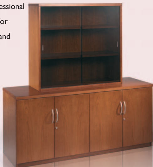
Cherry Shade 3

Hinged door storage, coupled with a sliding glass door bookcase, combines practical storage with a professional display area, ideal for managerial offices and executive areas.