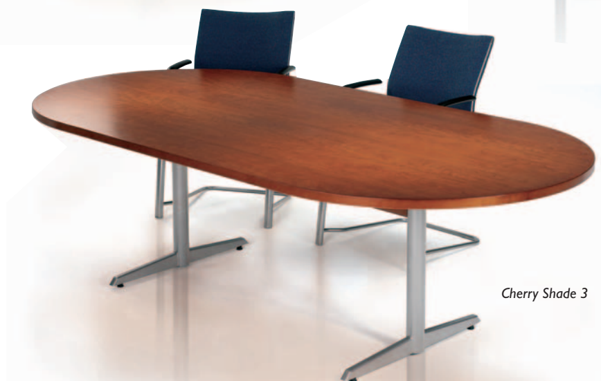
Cherry Shade 3

For a more versatile area, modular tables are offered with rectangular, semi-circular, trapezoidal or 90° annular tops enabling furniture to be easily combined, forming an endless number of configurations.