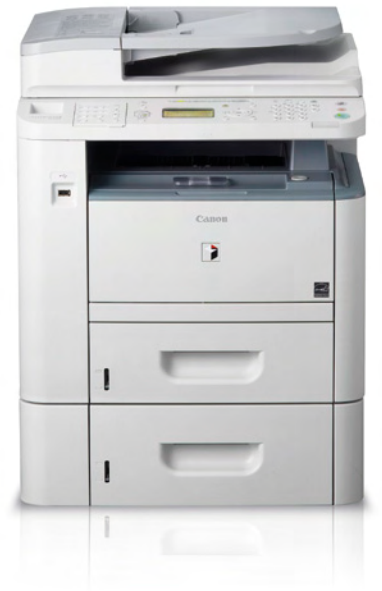
imageRUNNER 1133iF with optional paper cassette