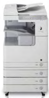
imageRUNNER 2520i with optional paper cassettes and DADF

We understand that while businesses face common issues every business is unique. That's why Canon's compact imageRUNNER Range incorporates a diversity of modular A4 and A3 multifunctional devices, enabling you to find a solution that best meets your needs.