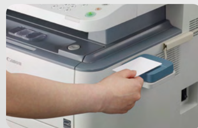
Optional uniFLOW card authentication

uniFLOW MyPrintAnywhere 1 – Documents can be picked up at the most convenient device on the network – irrespective of where they were initially sent.